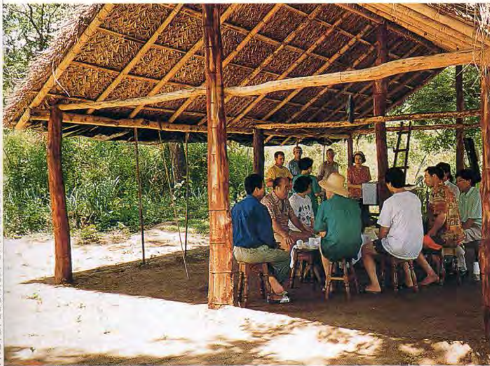
True Parents take a lunch break, attended by leaders who accompanied them during their stay at the farm.

Father said that the land will be divid-