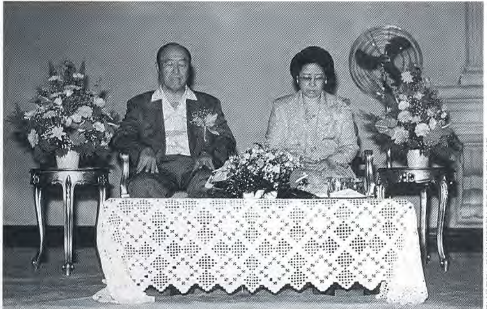
True Parents pray before the December 6 evening speech.

True Parents quickly became impressed with the rapid growth of the plants and with the fecundity of the lands. The fish that made True Parents very enthusiastic is called dourado, which means golden; they are actually golden color. Since it is