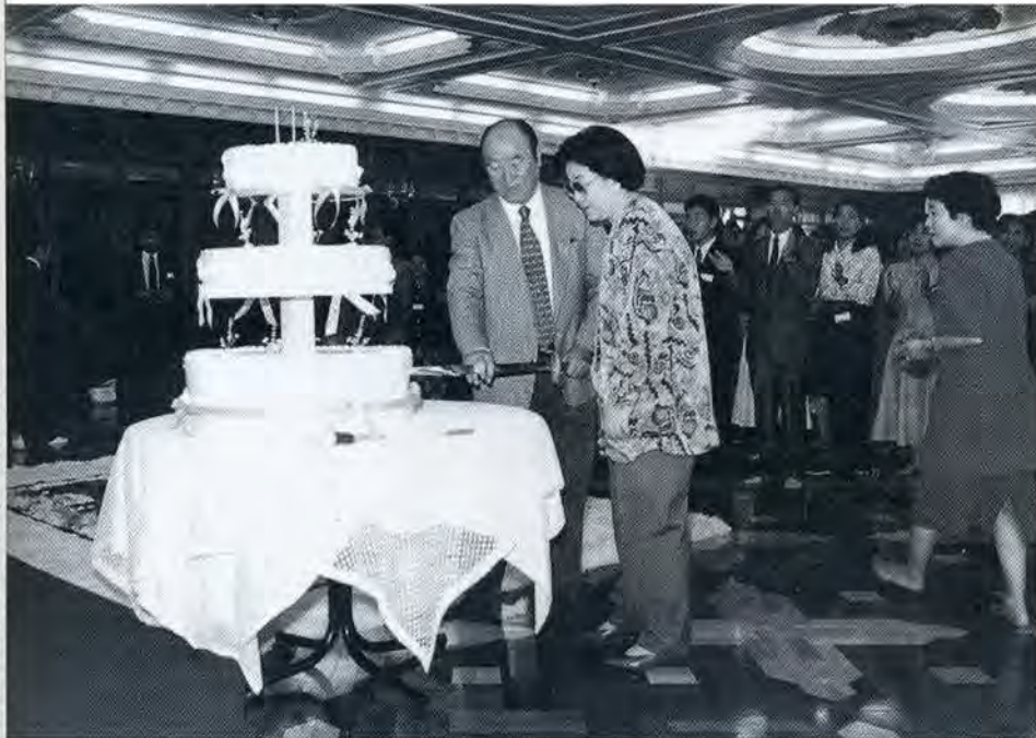
True Parents cut the cake at the welcoming ceremony in the Centro Nacional de Missões in Sao Paulo.

Take it easy and let the fish feel relaxed. Give it a bit of line so that the fish feels, 'Oh, what's going on? I thought I was hooked. Did I get free?' The fish waits a