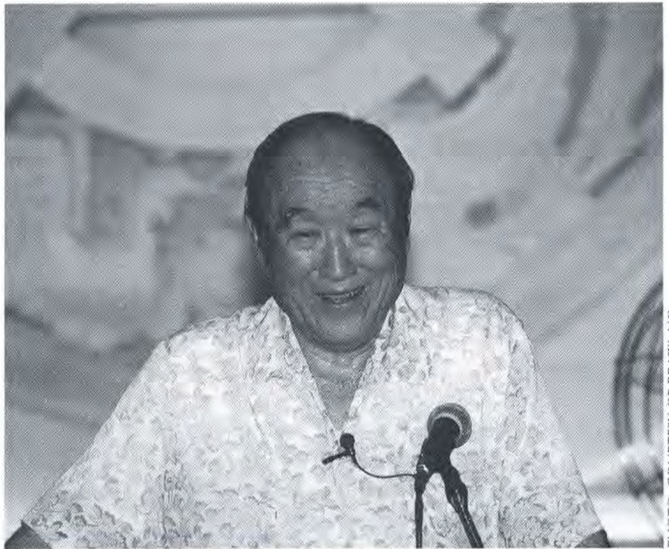
Father gives his first speech in the evening of December 6, 1994.

Perhaps I am ignorant about tropical fruits and that is why I was amazed; but in the front yard of the rancher's house were abundant fruits, including pineapples, papayas and mangoes. They had manioc, a sweet potato-like food, which is a staple food for people in Africa. The rancher cut a pineapple from their front