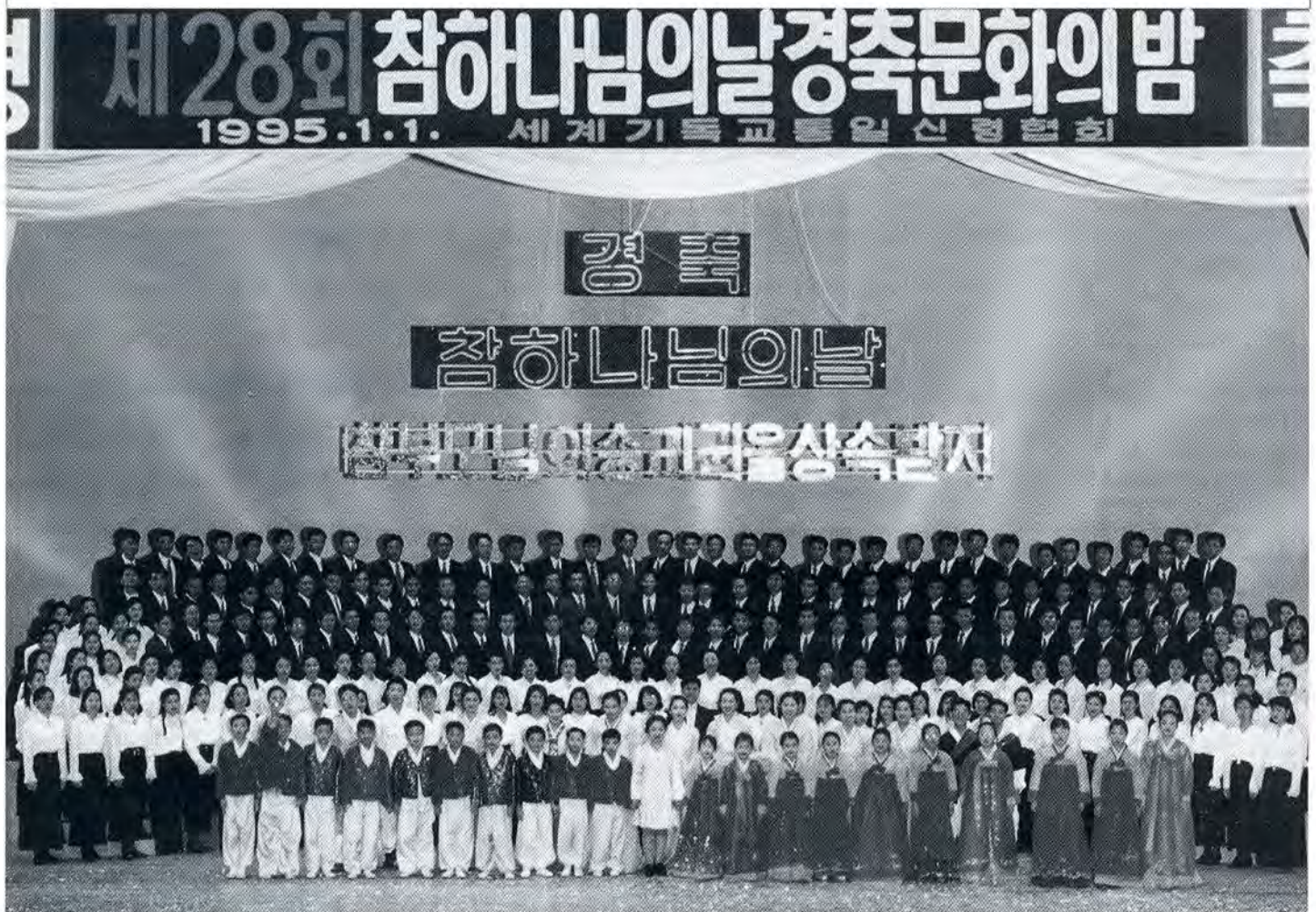
The finale of the True God's Day entertainment program at the Little Angels School in Seoul, Korea, January 1, 1995.

Where is the nation that can welcome True God's Day as a national holiday? Where can as many as forty million people