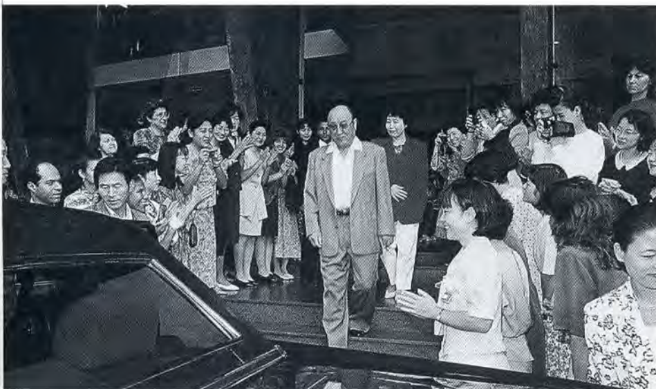
Father gets into the car to leave Sao Paulo.